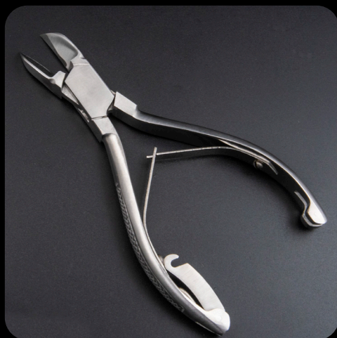
941-1261 5½" Double-Spring