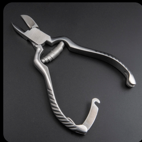
941-1259 5½" Barrel Spring