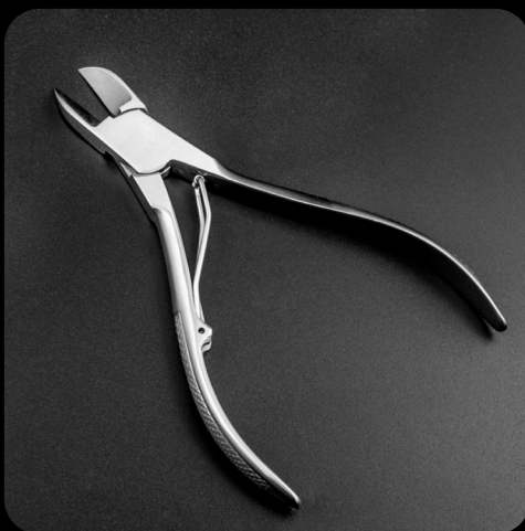
96-2666 4½" Concave Tip